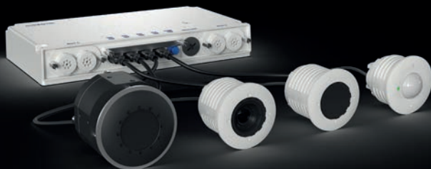
MOBOTIX S74/S74 Thermal Four Flexible Modules Combined in a Single Camera