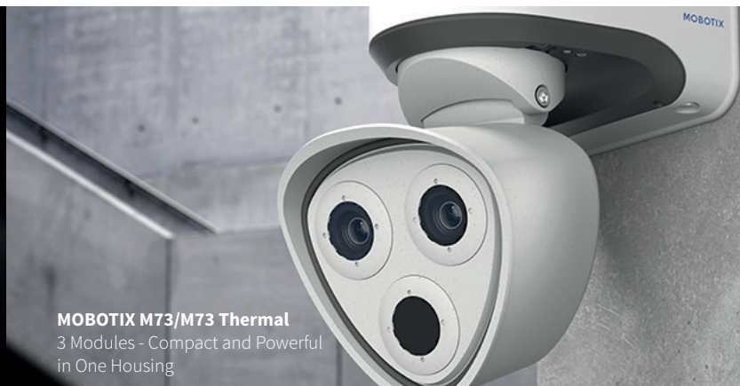
MOBOTIX M73/M73 Thermal 3 Modules - Compact and Powerful in One Housing